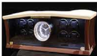
Buben & Zorweg Python V8 Top