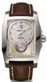
Breitling for Bentley Flying B Watch