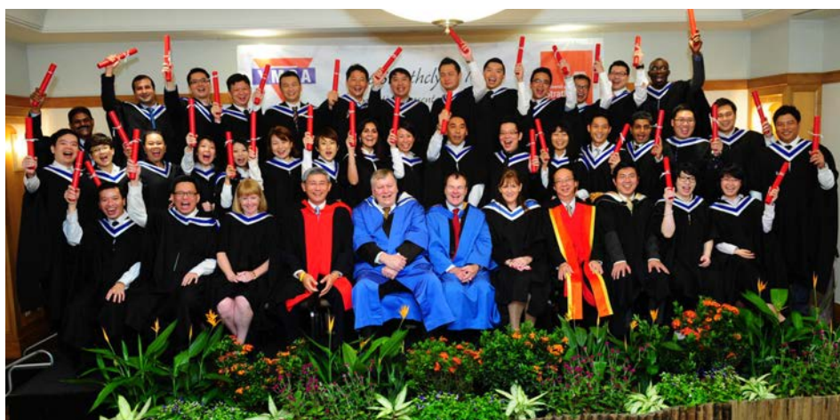
The Strathclyde MBA 2013 Graduates