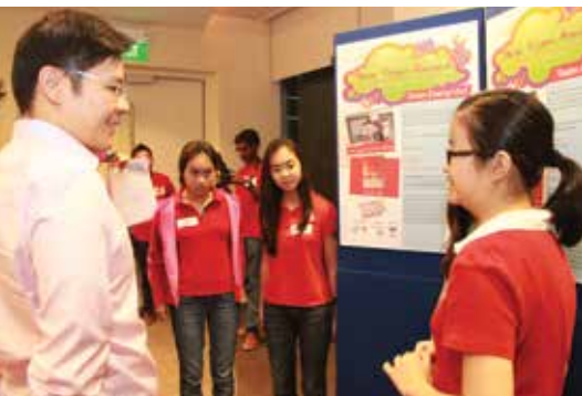
Team "EnergiZe!" making an impressive pitch to Mr Lawrence Wong