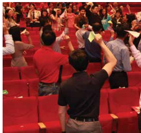
May all our dreams take flight!