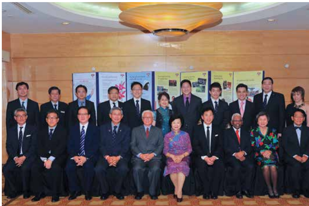
YMCA Board Directors, YMCA Advisory Council and YMCA Gala Dinner Organising Committee with President Tony Tan and M