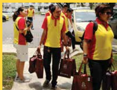
Distributing goodies at Care Corner SAC, Toa Payoh

Volunteers from DHL Global Mail (Singapore) supported four sessions of the YMCA Food of Love in 2012. One volunteer even offered the kitchen of her home for the baking of pineapple tarts. Thank you! Through the sessions supported by DHL Global Mail (Singapore), 320 needy elderly were blessed with goodies and food prepared by volunteers under the guidance of professional and hobby volunteer chefs.