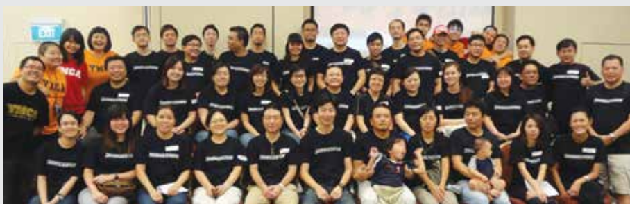
Beneficiaries from Handicaps Welfare Association at Y Makan Fellowship held at YMCA of Singapore, kindly sponsored by Bridgestone Tyre Sales Singapore Pte Ltd.

Briefing Date : 15 February 2013 Time : 7.00pm to 10.00pm Venue : YMCA of Singapore