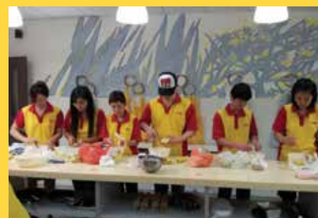
Baking with love at The Little Arts Academy