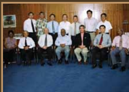
With YMCA Board of Directors 2006/2007