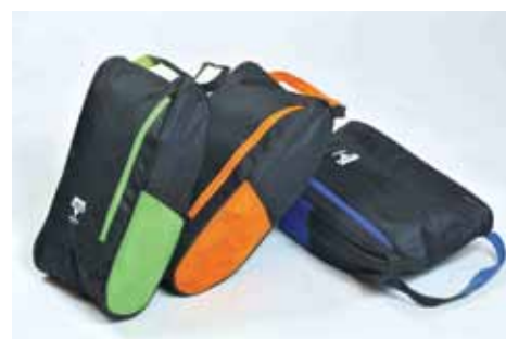
YMCA Shoe Bag Available in Blue, Orange and Green S$8 w/GST each

Enquiries: YMCA Member Services: 6586 2255