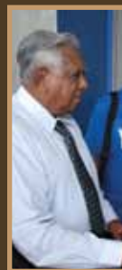
Praising and encouraging staff and volunteers during the event