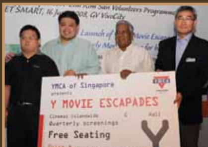
Launching Y Movie Escapades, a YMCA-Tan Chin Tuan Community Service Programme