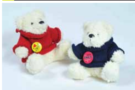
YMCA 7" Teddy Bear with YMCA button S$13 w/GST each