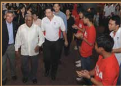
Receiving a warm welcome from YMCA staff and volunteers