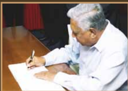
Signing the VIP guest book