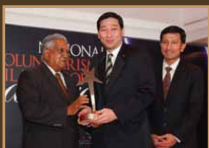
Presenting the NVPC Non-profit Organisation Award for Philanthropy Management 2007 to YMCA