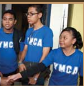
encouraging YMCA volunteers ent