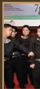
With Y STA and Recreation staff during their performance