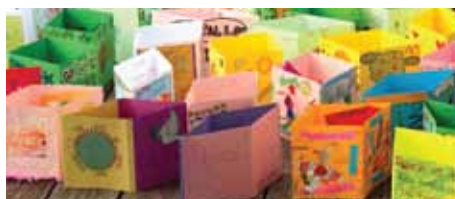
Peace Lanterns made with love by students of YMCA CDC and SSC