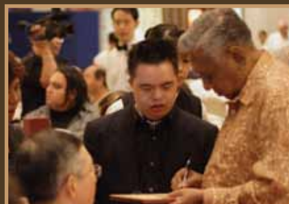
Taking time to sign an autograph for his fan