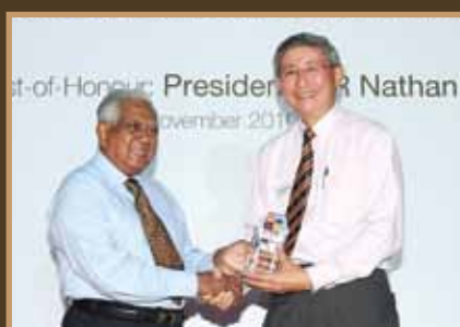
Presenting a token of appreciation to YMCA of Singapore in recognition of Citi-YMCA Youth For Causes being an event of President's Challenge since 2006

grace our many events including the YMCA Charity Golf in 2006 and 2007, YMCA Movie Premiere in 2008, Citi-YMCA Youth For Causes Awards Ceremony in 2010 and the Official Launch of "Lim Kim San: A builder of Singapore" in 2010.