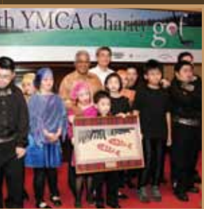
RS (YMCA Special Arts, Talents ion Society) beneficiaries after nance