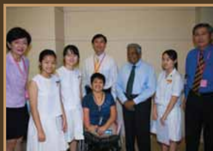
With Citi-YMCA Youth For Causes team Espoir' and VWO representative from Muscular Dystrophy Association (Singapore)