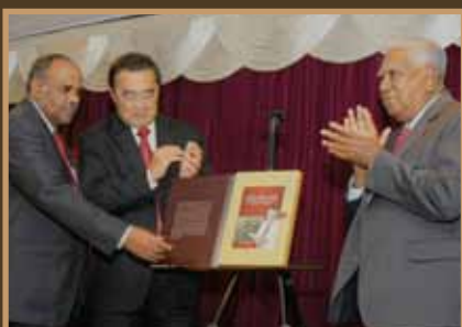
Officiating the launch