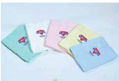
YMCA Towel Available in Blue, Pink and Green S$8 w/GST each