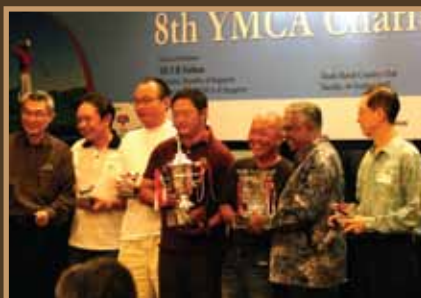
Celebrating with the Lim Kim San Corporate Challenge champions