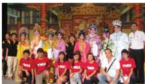
YMCA volunteers and the Cantonese Opera performers posing for a picture memento

On September 17, over 100 volunteers from YMCA of Singapore and Queenstown Community Centre came together at YMCA Opera Treats to teach, learn and perform Cantonese opera to build stronger intergenerational ties with 160 needy elderly beneficiaries from Asian Women's Welfare Association, Peace Connect, MacPherson Moral Senior Activity Centre and Christalite Methodist Home.