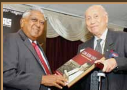
Presenting personally autographed books to YMCA-Lim Kim San Volunteers Programme Charter Donors

YMCA of Singapore expresses our deepest appreciation to Mr S R Nathan for his distinguished life-long service to the nation since 1955, culminating in the Presidency of the Republic of Singapore for the past 12 years. YMCA of Singapore is particularly touched and inspired by Mr Nathan's tremendous efforts to raise awareness on social concerns and to rally support for the social service sector through the annual President's Challenge which he initiated in 2000.