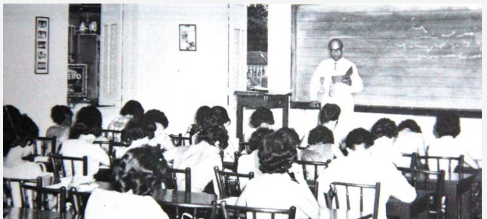
A Shorthand class in the 60's

For more information about the YMCA Education Centre, please visit the website at www.ymca.edu.sg