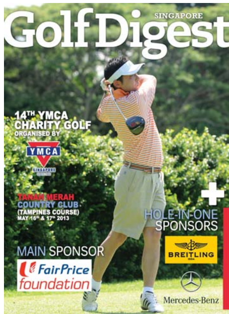
Personalised gift for each golfer: Individual tee shot on mock cover of Golf Digest Singapore magazine

The 14th YMCA Charity Golf was held over two days from 16 to 17 May 2013 at the Tanah Merah Country Club to raise funds for the YMCA-Lim Kim San Volunteers Programme to recruit, develop and recognise volunteers.