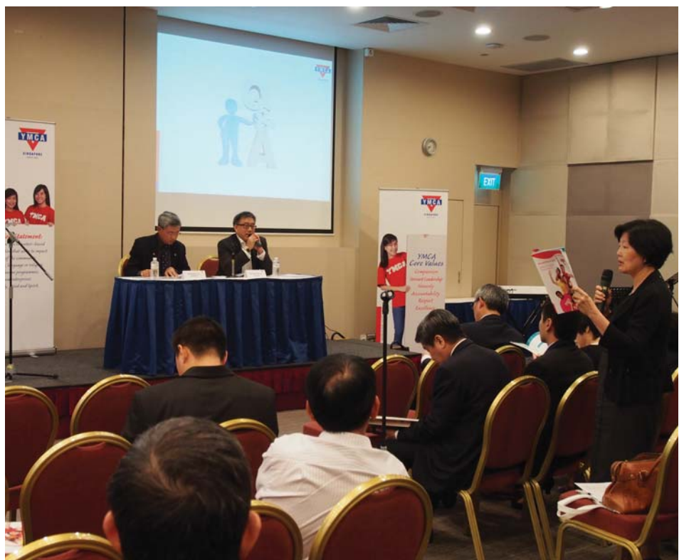
Q & A session for YMCA members to seek clarifications after the various presentations

Let us continue to uphold our leaders in prayer as they lead the YMCA of Singapore to greater heights, for the glory of God.