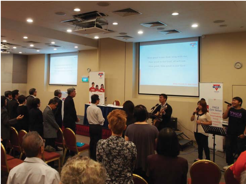
The AGM opens with a Praise & Worship session led by YMCA staff