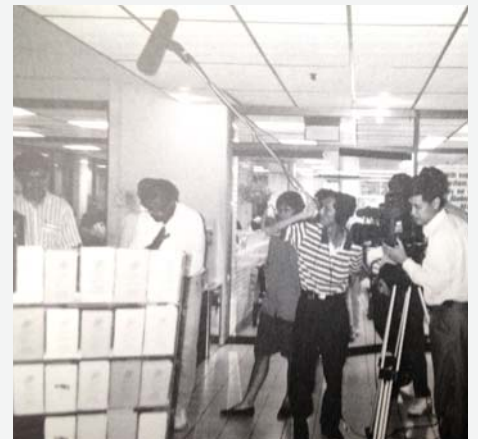
Film making enrichment programme in the 90's

Recognising that students need 21st century skills to be successful today, emphasis is placed on critical and creative thinking, civic literacy, cross-cultural skills and information and communication skills through the academic curriculum and co-curricular activities, through dedicated lessons and teachable moments. All this is delivered by the team of qualified teachers and lecturers