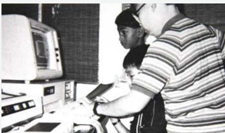
Computer classes in the 80's

By 1919, Shorthand and Book-keeping classes were started and the number of students increased year by year. Typewriting and Accountancy were added to the syllabus in 1931. More commercial classes, classes for Standard V to School Leaving Certificate as well as London Chamber of Commerce Examinations Preparatory courses were introduced subsequently.