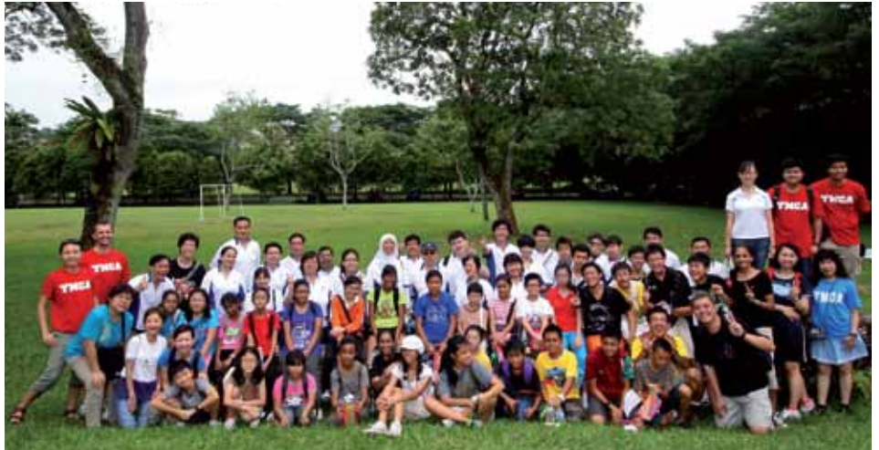
Y Nature Walks: YMCA volunteers, NTUC FairPrice staff with Teck Ghee Youth Care Corner beneficiaries