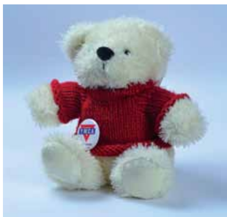
YMCA 7" Teddy Bear with YMCA button badge S$13 w/GST each