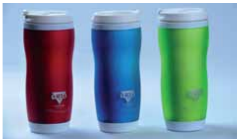
YMCA Tumbler S$9 w/GST each