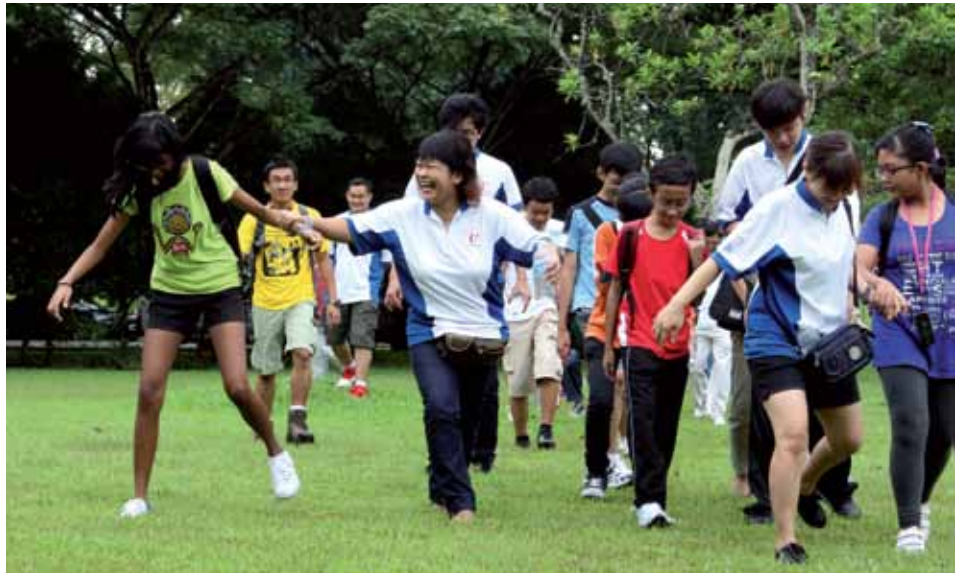
A Y Nature Walk through MacRitchie Reservoir Park