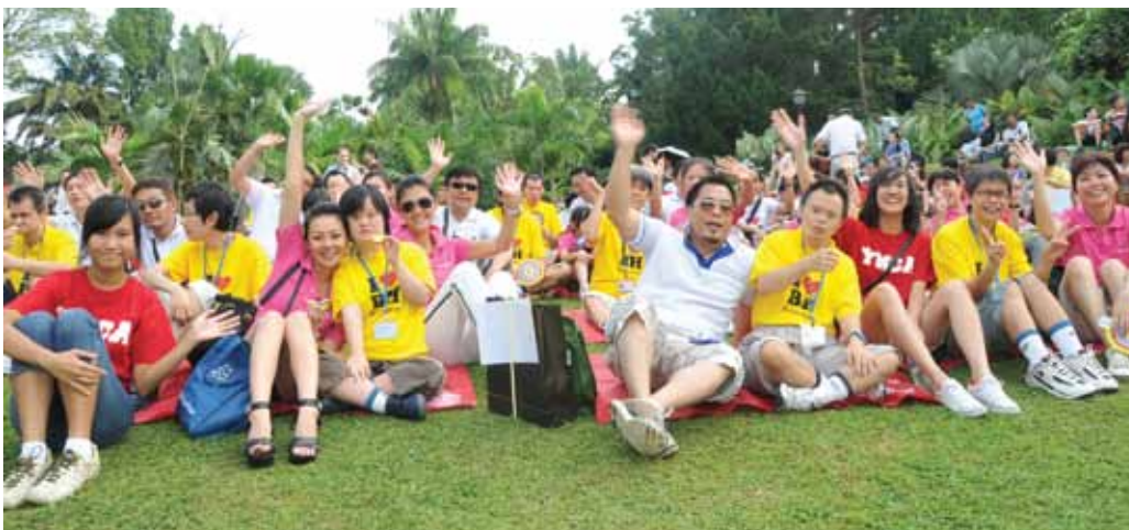
Having fun together: Bridgestone Tyre Sales Singapore staff and Bishan Home for the Intellectually Disabled residents