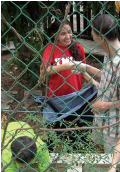
YMCA volunteer giving a helping hand