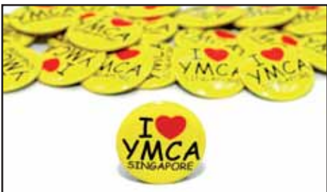
YMCA button badge S$1.50 w/GST each