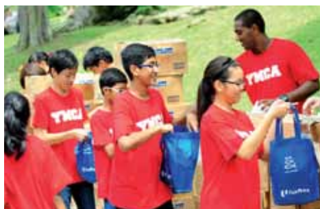
1,000 goodie bags sponsored by NTUC Fairprice, Eagle Eye Centre, Yeap Medical Supplies