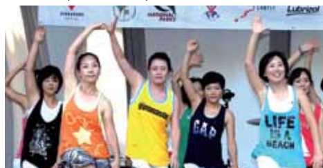
Fitness routine by YMCA Korean Mums group