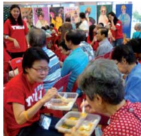
YMCA volunteers and beneficiaries