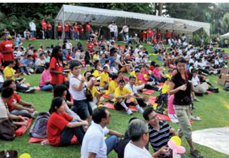
A perfect afternoon for YMCA Proms @ the Park for beneficiaries, volunteers, guests and tourists