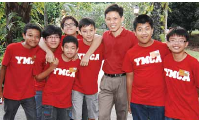
YMCA volunteers rewarded with a souvenir snapshot with Acting Minister MG (NS) Chan Chun Sing