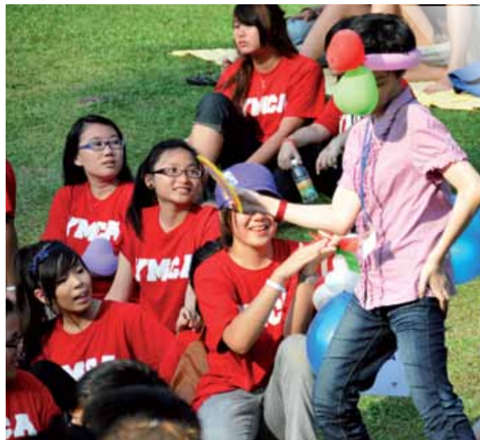
A beneficiary enjoying herself and entertaining YMCA volunteers

For more information on YMCA Proms @ the Park, please visit www.ymca.org.sg/promsatthepark