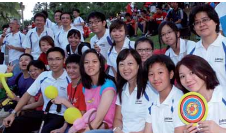
Lubrizol Southeast Asia befriending Spastic Children's Association of Singapore beneficiaries