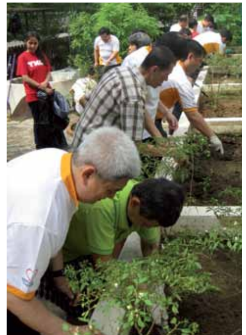
Y Green Fingers: NTUC FairPrice staff with Bishan Home for the Intellectually Disabled residents