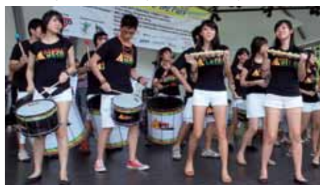
Percussion performance by SMU Samba Masala