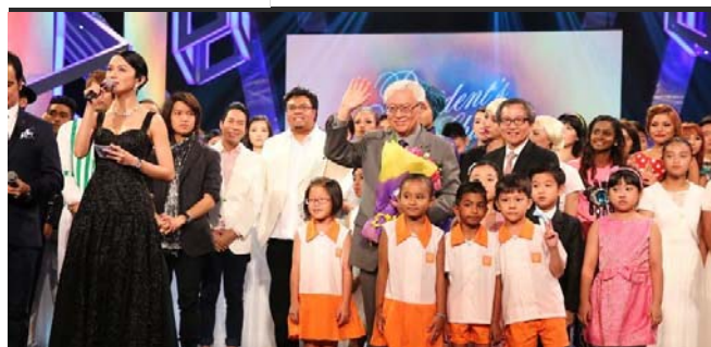
2014's President's Star Charity show raised more than S$6.3 million.